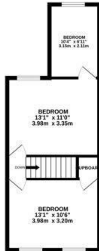
TOTAL FLOOR AREA: 844 sq ft (78.4 sq m) approx.

While every attempt has been made to ensure the accuracy of the figures contained here, measurement of doors, windows, rooms and any other items are approximate and no responsibility is taken for any error, omission or mis-statement. This plan is for illustrative purposes only and should not be used as such by any prospective purchaser. The services, systems and appliances shown here are not shown and no guarantee as to their operability or efficiency can be given. Made with MyPlan 11/2020